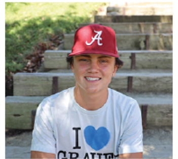
Zach H. Column Writer