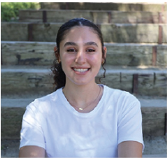
MJ C. Layout Editor, Column Writer